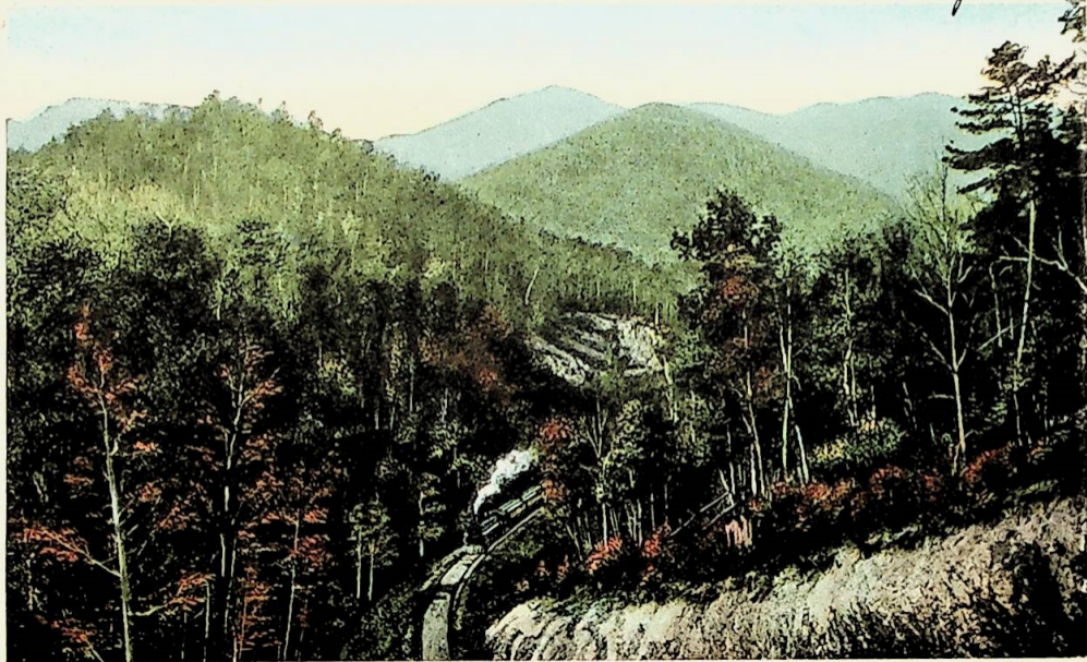
B-17. PENETRATING THE BLUE RIDGE, "IN THE LAND OF SKY."