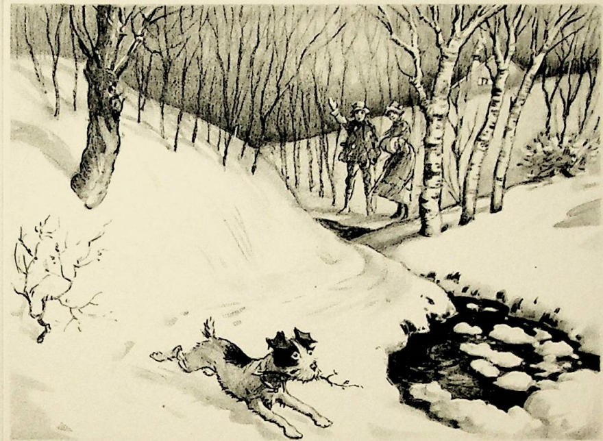
THE - SEASON'S - GREETINGS